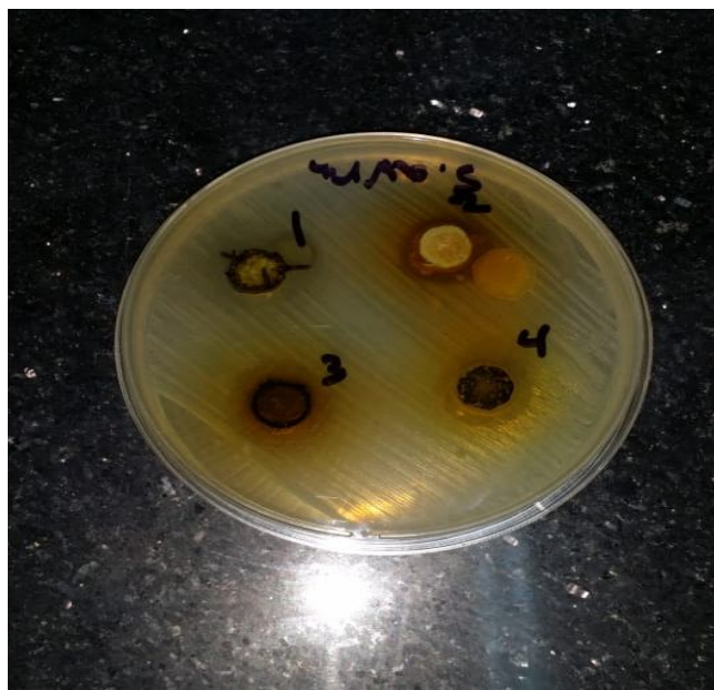
Fig. 1: S.aureus susceptible to Laurel in well number 4 in Mueller-Hinton agar

Performance standards for antimicrobial susceptibility testing. Resistances: 0-14, Sensitivity:17.